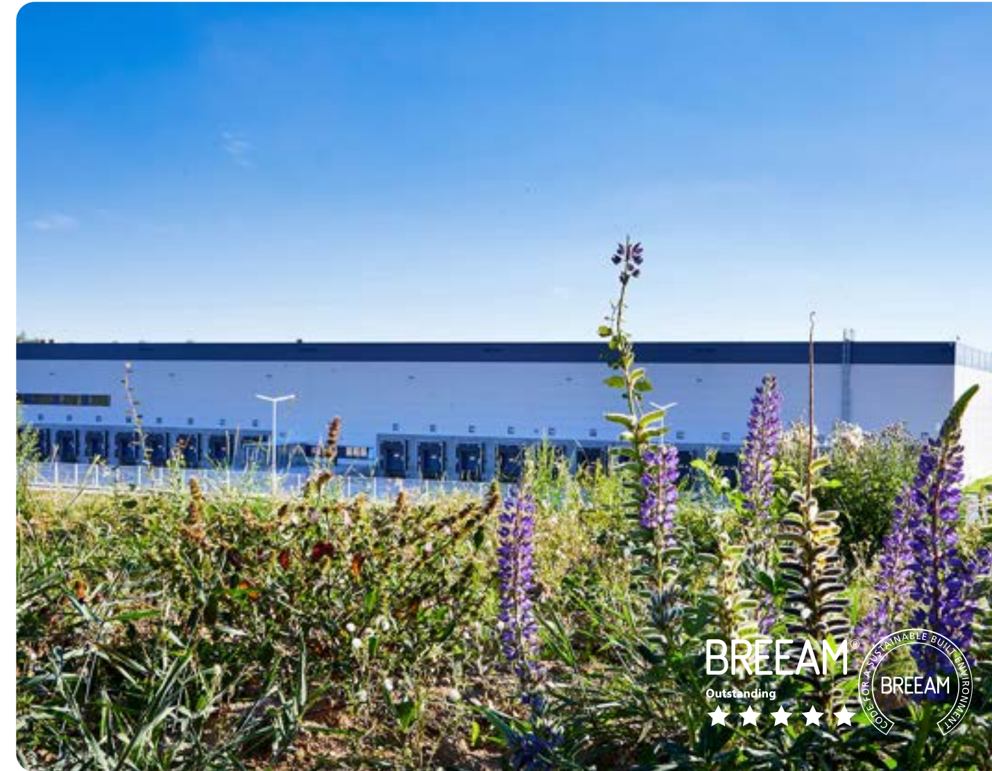
PARK CHEB SOUTH

Accolade is focused on creating environmentally conscious portfolios in the real estate industry with green building certifications as a standard, such as BREEAM or DGNB. These certifications evaluate various aspects, including energy use, health and wellbeing, pollution, transport, water, materials, waste, ecology, and resilience. These certifications underscore the robust sustainability initiatives implemented at the Cheb South, Stribro, and Szczecin industrial parks. Szczecin industrial park holds the distinction of being the first project in Poland's industrial and logistics construction sector to receive the highest level of BREEAM certification. Moreover, a facility at the Cheb South industrial park is particularly notable for obtaining BREEAM Outstanding certification. Accolade's successful transformation of the Park Cheb site further testifies to its eco-conscious ethos; this industrial park was built following a complete revitalization of a former brownfield site that once hosted engineering plants. These significant strides solidify Accolade's commitment to championing environmentally friendly practices within the sector of industrial real estate.