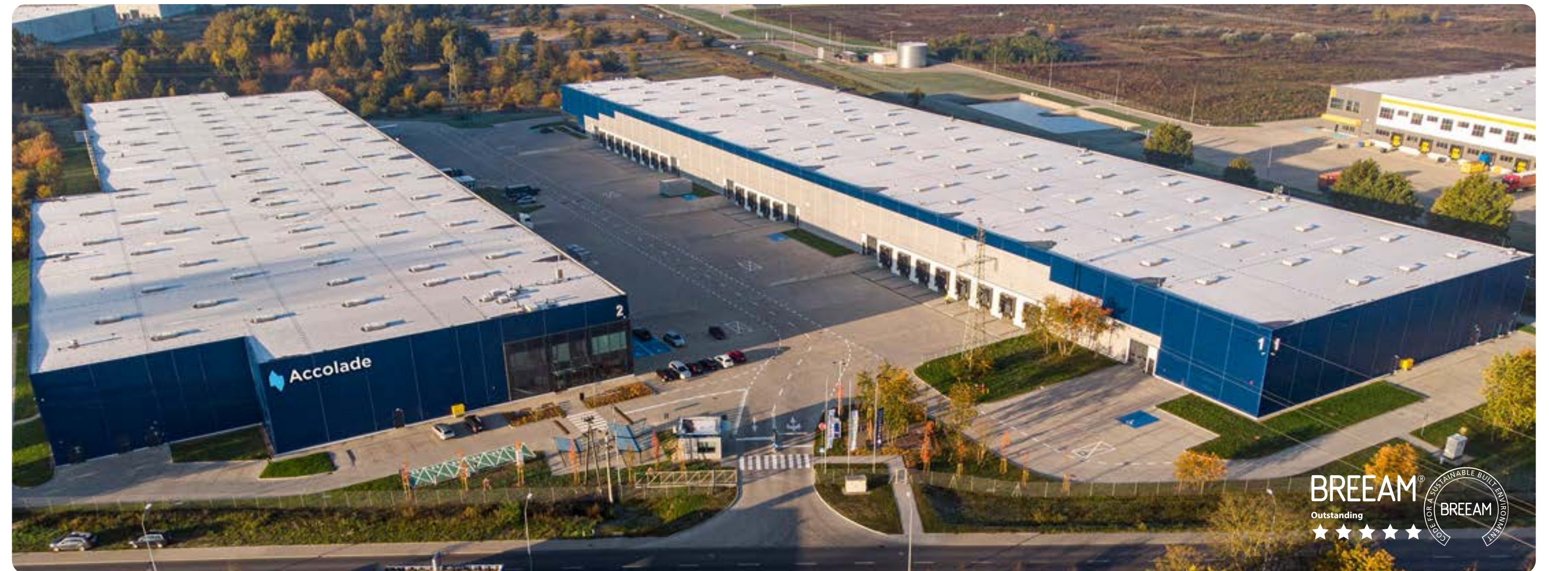
PARK SZCZECIN III